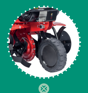
TRANSPORT WHEEL quick tilting