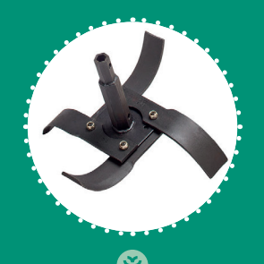
ROTAVATOR EXTENSION work width 112 cm