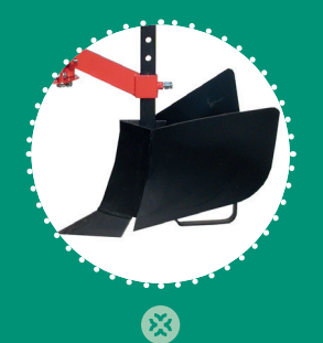
RIDGING PLOW with adjustable wings