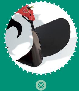
RIDGING PLOW with fixed wings