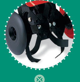
ROTAVATOR EXTENSION work width 75 cm *only B&S625/EURO R170