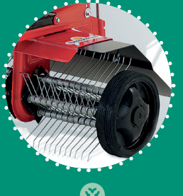
AERATOR spring-type, 50 cm