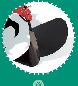
TAMPING MACHINE with fixed wings